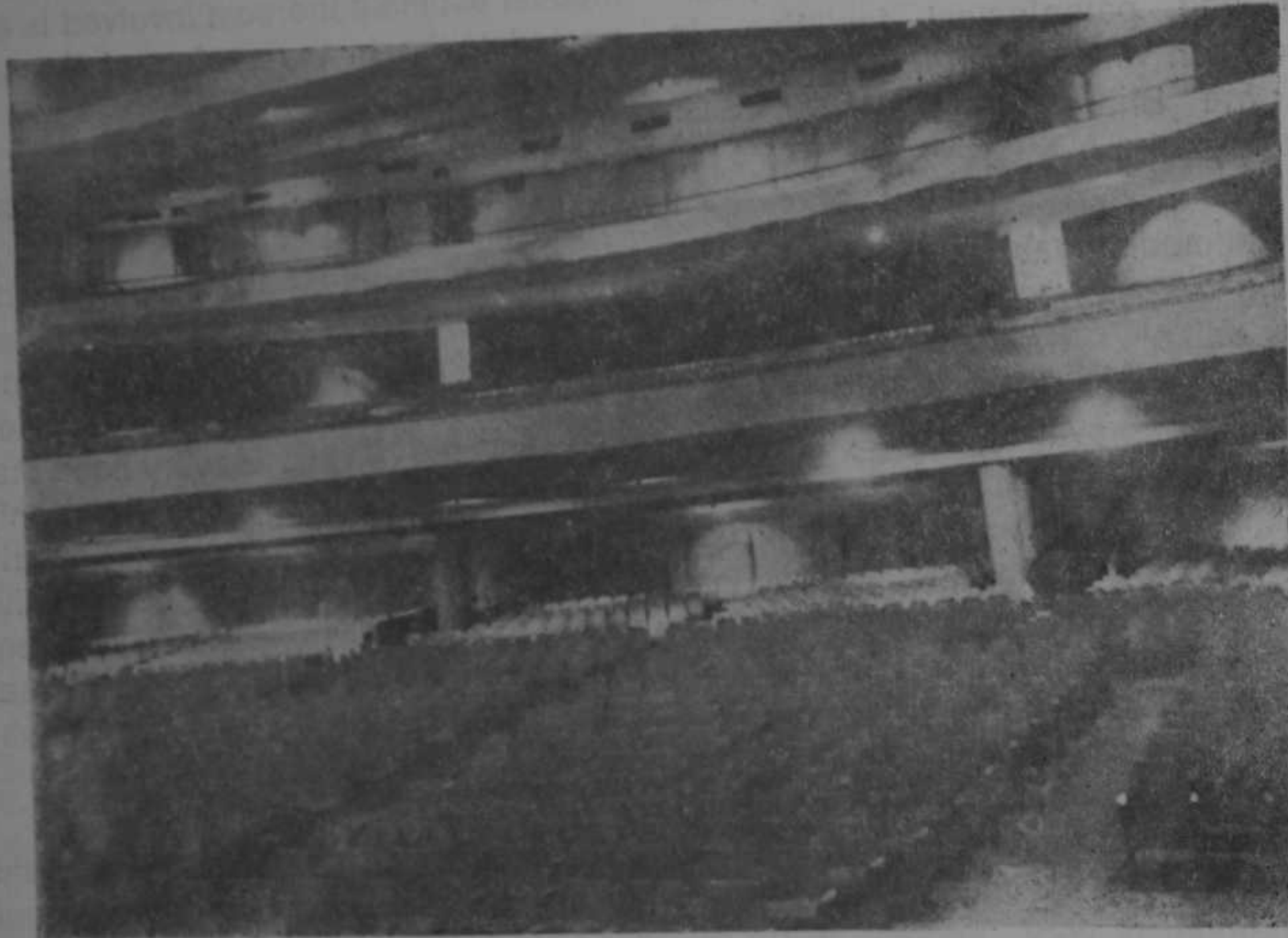
The Hall Before